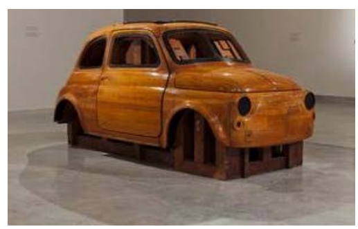
Design with va-va-vroom