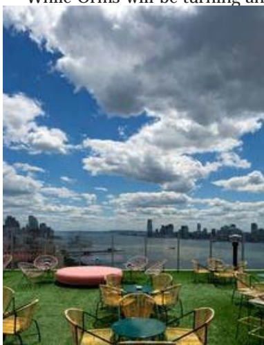
Rooftop of The Standard High Line

While Orms will be turning an old office block into chic accommodation,