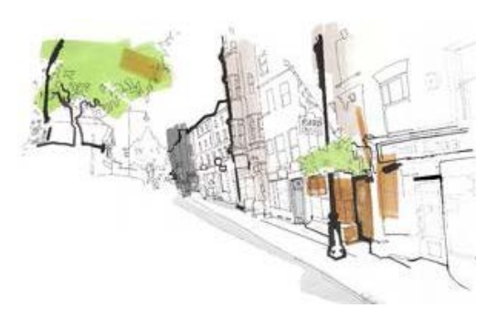
Capital investment: the evolution of luxury London