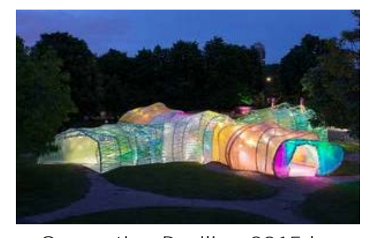
Serpentine Pavilion 2015 by SelgasCano unveiled