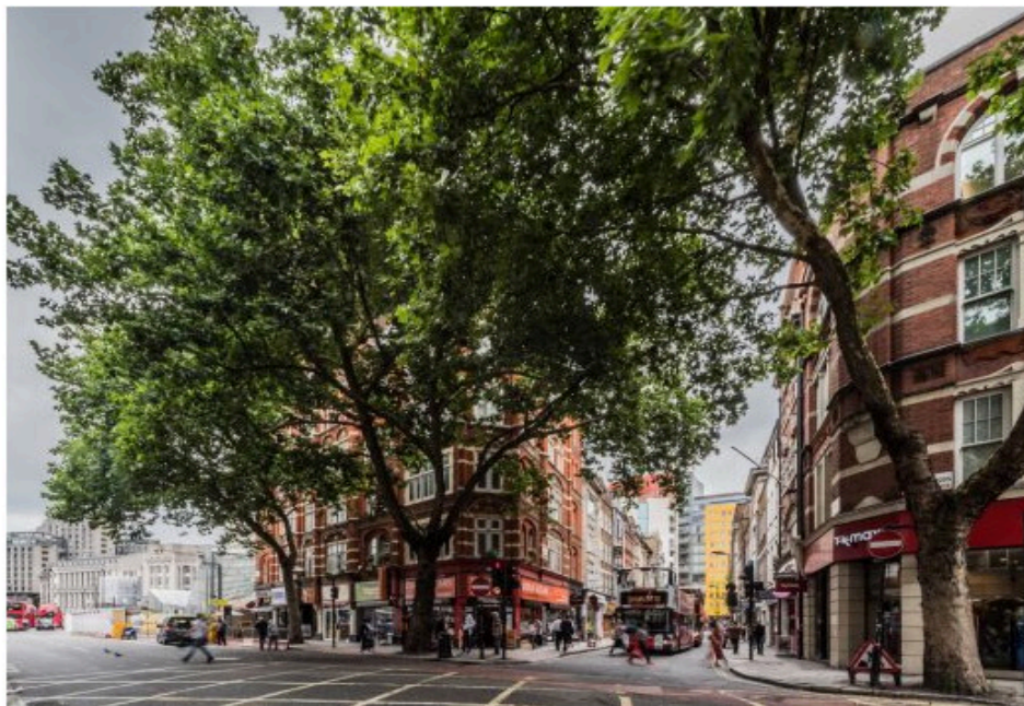
Tottenham Court Road Retail Units in London images and information from Orms